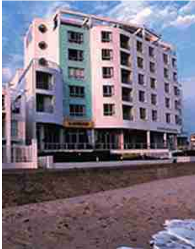
Strand Beach Hotel

A registration form was also attached for the Cigré 5th Southern Africa Regional Conference should you wish to extend your stay and attend the Cigré Regional conference which follows immediately after the PIESA Regional Workshop.