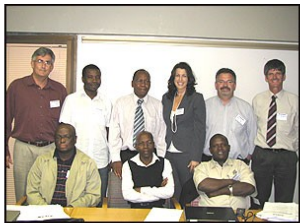
The Non technical loss reduction WG after a hard days work at ECC October 2008