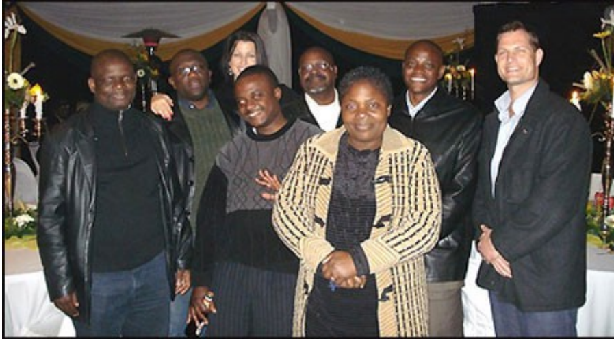
Members of the ICS and ZESCO teams having fun at the SARPA Convention evening function at the Zoological gardens of Tshwane