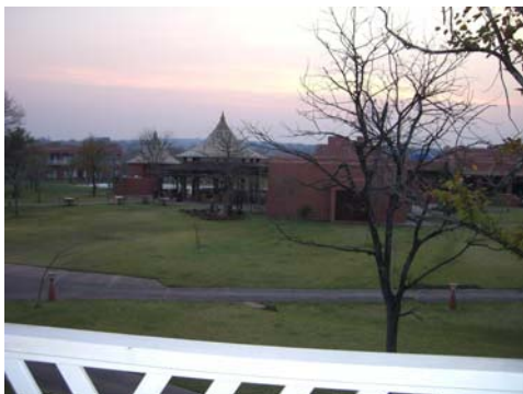
View from a room in the Zambezi Sun hotel. The accommodation is set out in a semi-circle around a variety of entertainment and eating facilities. The Convention Centre is adjacent to the building on the right of the photograph.

More information will follow in future Newsletters!