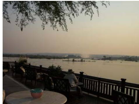
"Sundowner" drinks on the deck of the Royal Livingstone above the mighty Zambezi River with Victoria Falls providing the perfect backdrop. As the sun begins to sink on the horizon, the hippos begin to emerge from between the banks of the islands: ears and eyes start to rise above the water, then the chorus of groans and roars begins to join the dusk chorus of birds and insects.