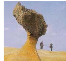
The Queen's Head

The day's journey took a very different turn with a walk through a lively area in Taipei where the narrow streets are teeming with happy people, and the hundreds of little shops and kiosks sell everything from foot massage to the latest fashion accessories. And, as seemed to be the case everywhere else, every second vendor sells food, food and more food to a populace that miraculously remains slender!