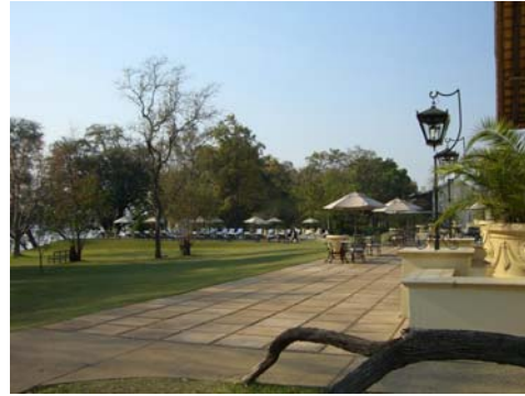
Luncheon preparations on the sprawling lawn between the Zambezi River and the Royal Livingstone hotel. The Royal Livingstone is a mere 5 minute walking distance from the Zambezi Sun and the Convention Centre. But be prepared for delightful distractions: cheerful zebras stroll across the lawns, a giraffe or two that happen to be munching a few meters away, or troops of small monkeys always ready for mischievous games.