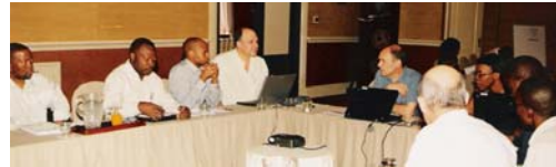
Standardisation Working Group in action

line with the 2007-2009 PIEASA Strategic Business Plan.