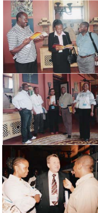
Discussions after the AGM (L-R: (representatives of KPLC, LEC, Eskom and AMEU))

The Chairman presented the 2006/07 Annual Report and audited Financial Statements. (The Annual Report is available on http://www.piesa.com ).